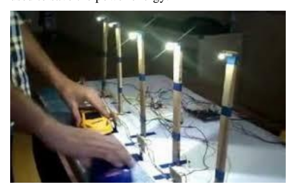
Fig.3.2. Working model.

represents the works of Smart Street Lighting System. When objects or vehicles appear to the sensors it is detect movements of the objects and street lights automatically ON. Then objects crossed to the sensors lights go to turn OFF. It is used to save the power energy.