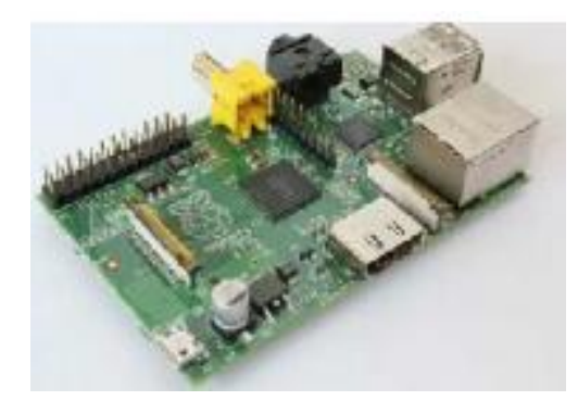
Fig.3.1. Raspberry pi controller.

Espressif Systems "Smart Connectivity Platform (ESCP) of high performance wireless SOCs, for mobile platform designers, provides unsurpassed ability to embed Wi-Fi capabilities within other systems, at the lowest cost with the greatest functionality. ESP8266 offers a complete and selfcontained Wi-Fi networking solution, allowing it to either host the application or to offload all Wi-Fi networking functions from another application processor. Alternately, serving as a Wi-Fi adapter, wireless internet access can be added to any microcontroller based design with connectivity through UART interface or the CPU AHB bridge interface.